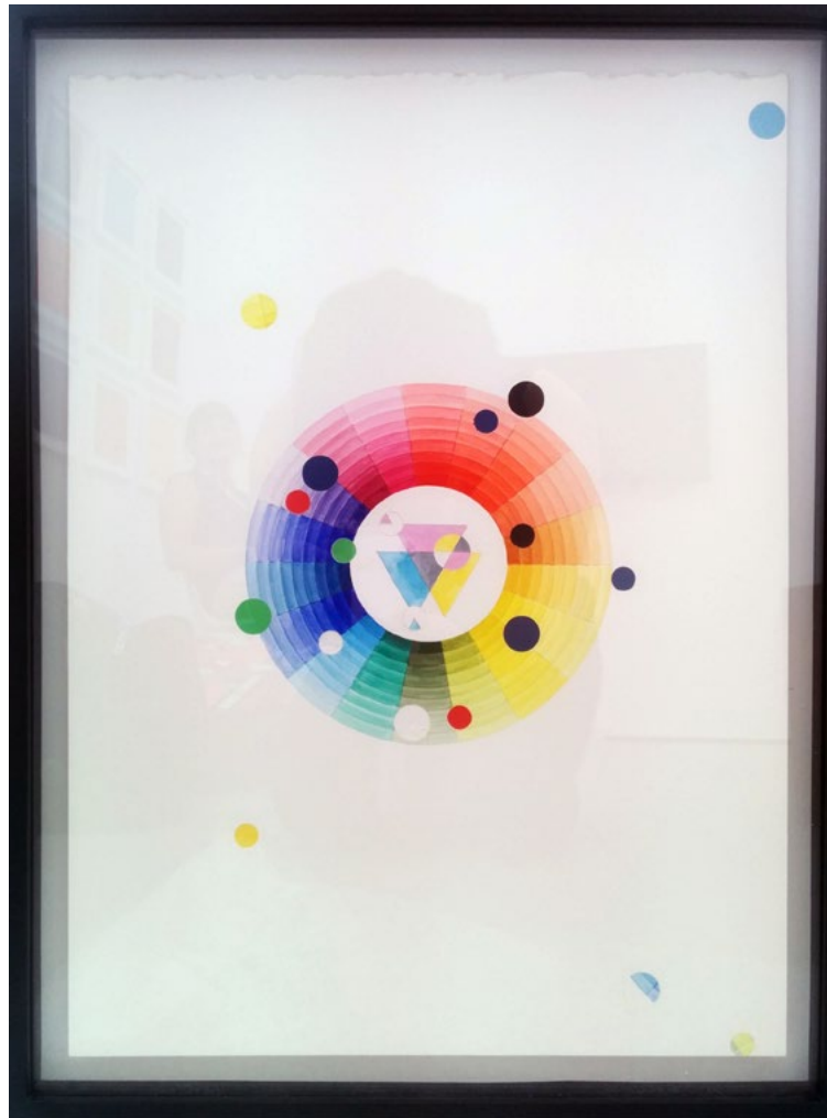
Chromatic # 3 Watercolor and paper Cut 43 x 31 cm / 16.8 x 12.1 inches Framed. 2014