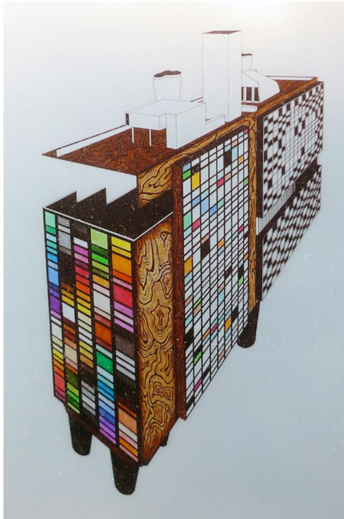
Materiales Nobles / Noble Materials Print on Aluminium paper 40 x 30 cm /15,7 x 11, 8 Inches Edition of 10 2014