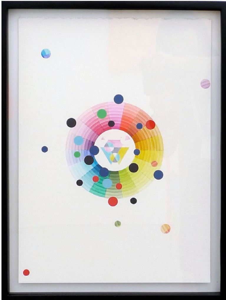
Chromatic # 2 Watercolor and paper Cut 43 x 31 cm / 16.8 x 12.1 inches Framed. 2014