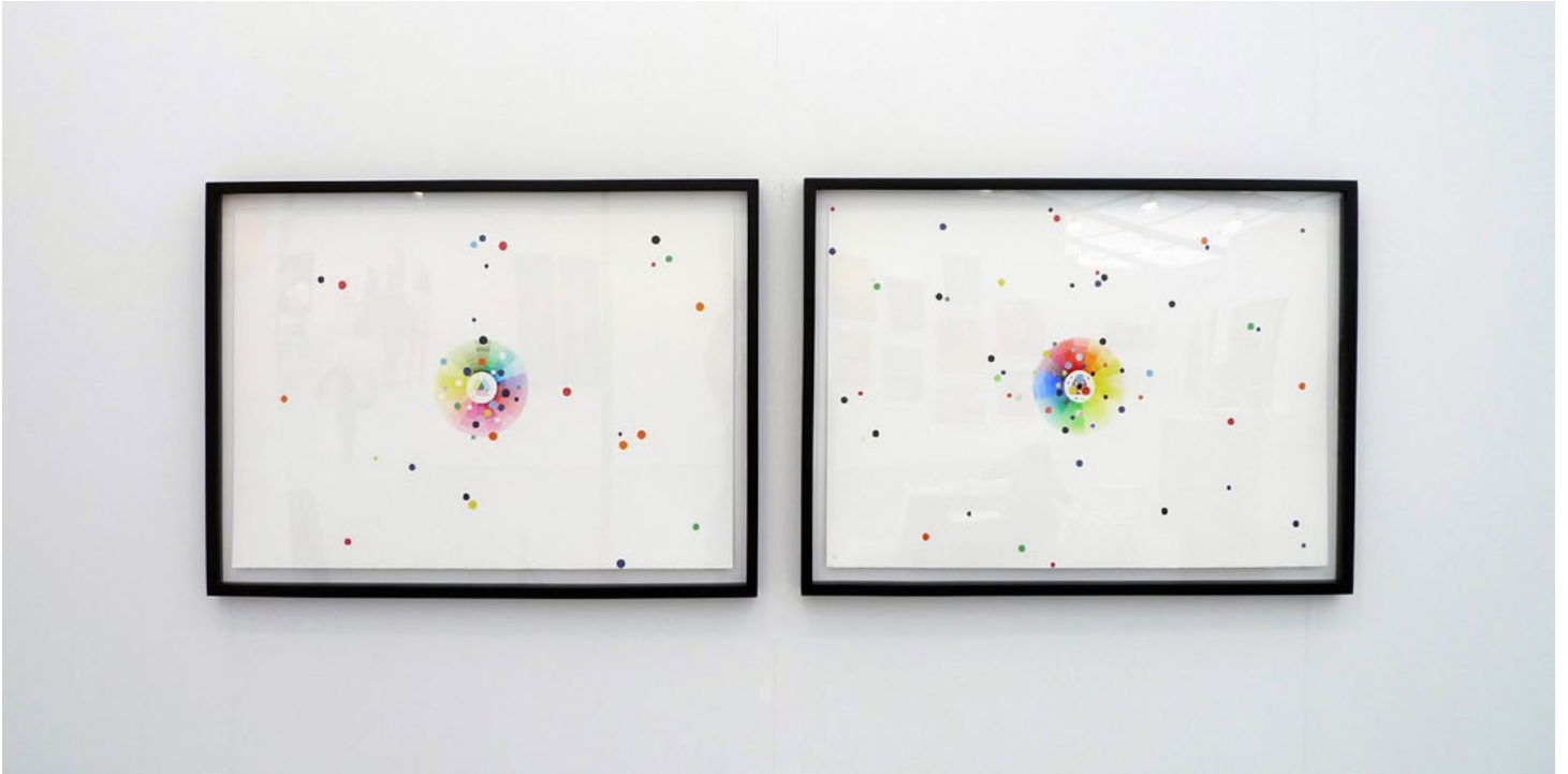
Chromatic # 3 Watercolor , Paper Cut. 77.5 x 112 cm / 30.2x43.7 inches 2014