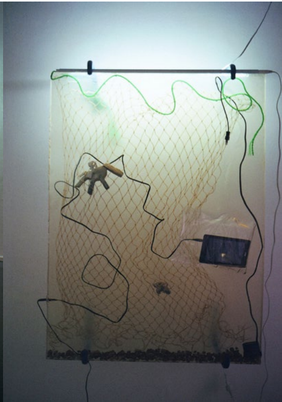
Blade Resin, net, stones, tablet Mixed Media 40 x 60 cm / 15.8 x 23.6 Inches 2014