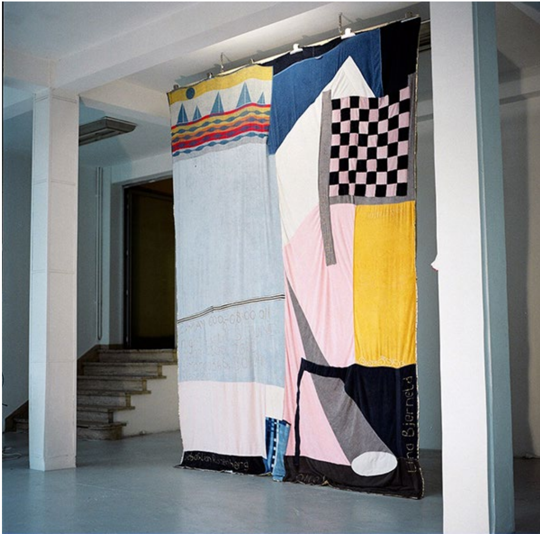
Plage de Bureau, Collage of bath towels & Emergency Blanket 4 x 3 meters/ 13.1 x 9.8 foot 2013