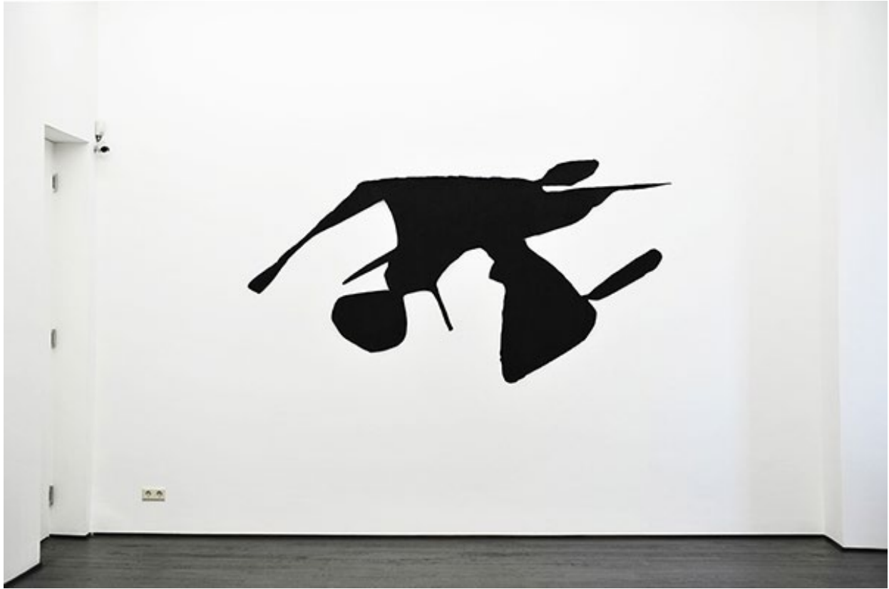
lack light please, stay late for waffle grace, drenched in lazer flying maze, solid shape, full speech bubble e mumble Laser Cut wool felt 2013