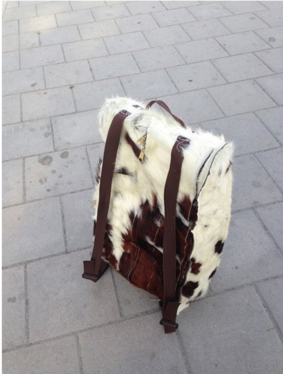
Ooo oh oh Cow fur and leather 100 x 40 x 30 cm / 39.3 x 15.7 x 11.8 inches 2014