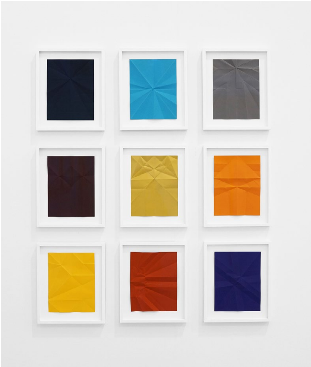
Untitled. Framed Colored Paper From the Series En Plein Air 9 pieces, 14" x 10" / 35 x 25 cm each. Framed 2014 $12000 USD

Sheets of colored paper whose creases are the result of the airplanes they once were as well as a template for the airplanes that they could become again.