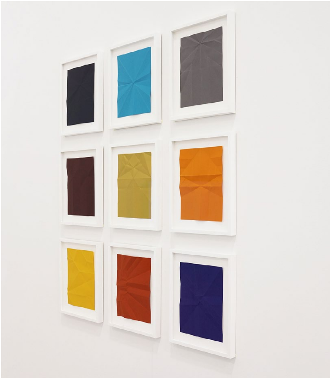
Untitled. Framed Colored Paper From the Series En Plein Air 9 pieces, 14" x 10" / 35 x 25 cm each. Framed 2014 (Laterall View)

Sheets of colored paper whose creases are the result of the airplanes they once were as well as a template for the airplanes that they could become again.