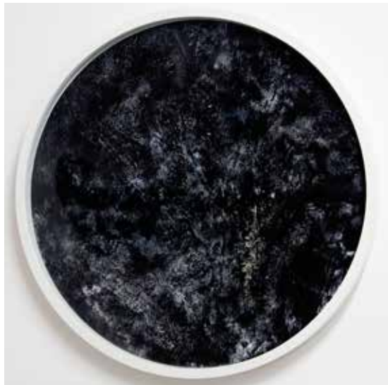
0.1.2 Presente Pigmento sobre hierro 85 x 85 cm 2019