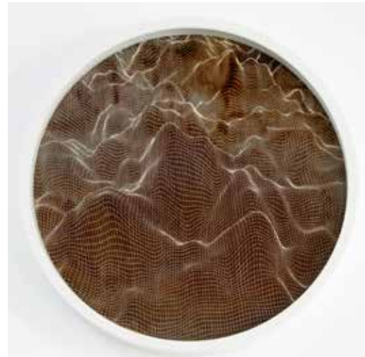
0.2.2 Terreno estriado/ Fluted ground placa de hierro/ Iron Plate 42,6 x 42,6 cm 2019