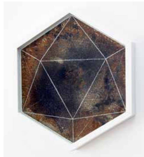
0.3.5 Sólidos Platónicos: Icosaedro/ Pla- tonic solids: placa de hierro/ Iron Plate 30 x 33 cm 2019