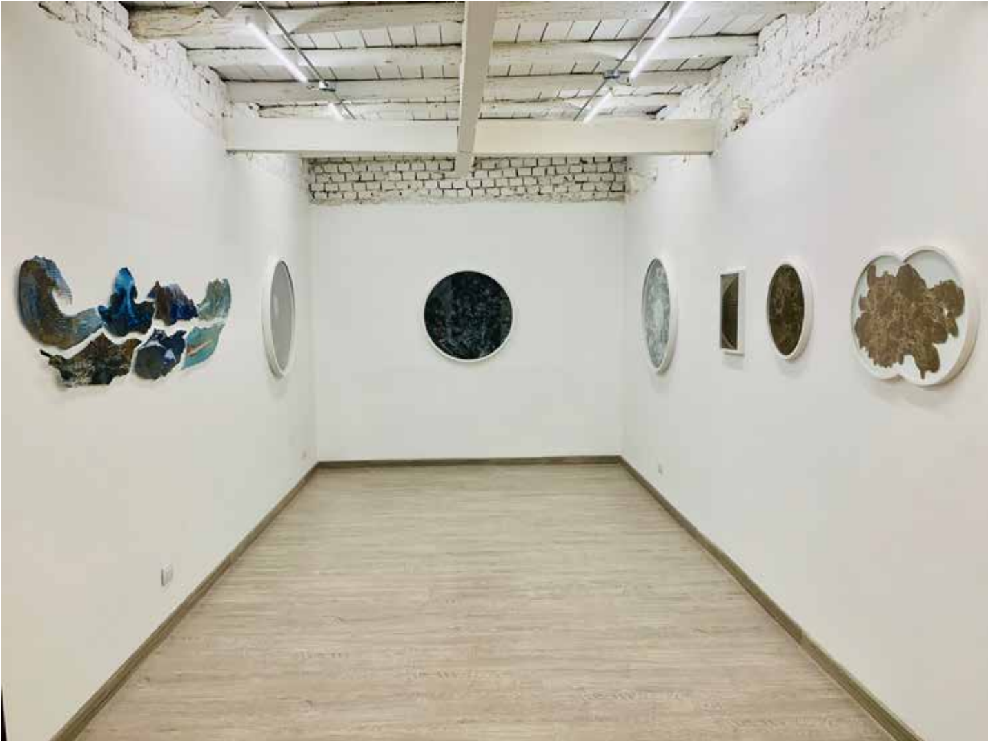
vista general de la exposición / General view of the show