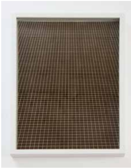
0.2.1 Terreno Liso placa de hierro/ Iron Plate 27,2 x 42,6 cm 2019