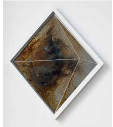
0.3.3 Sólidos Platónicos: Octaedro /Pla- tonic solids: Octahedron placa de hierro/ Iron Plate 32 x 38 cm 2019