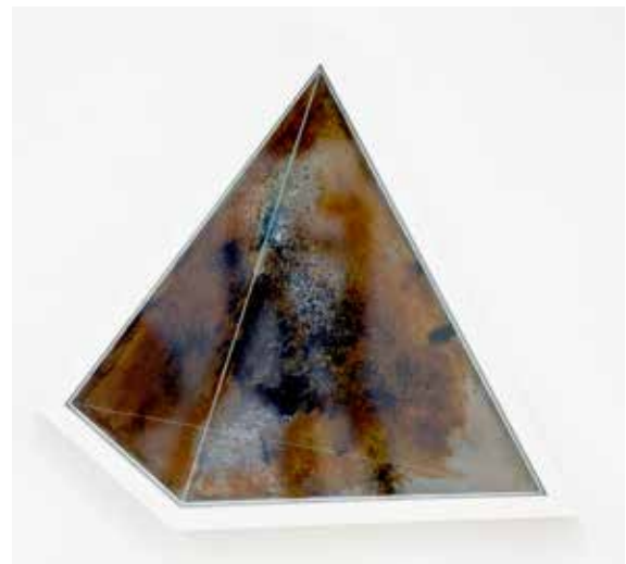
0.3.1 Sólidos Platónicos: Tetraedro / Pla- tonic solids: Tetrahedron placa de hierro/ Iron Plate 34 x 32 cm 2019