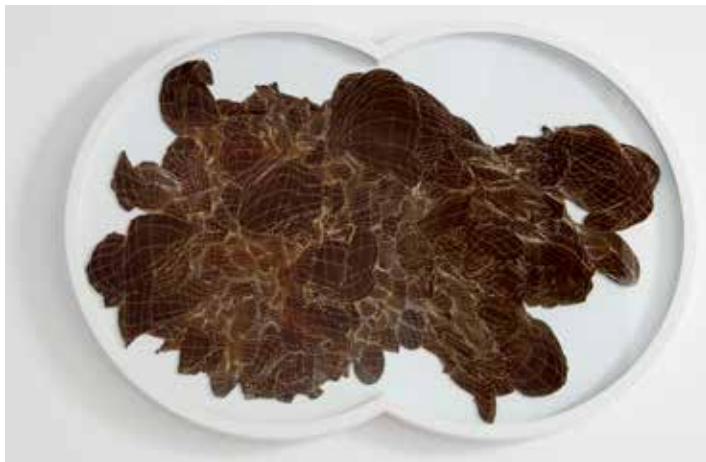
0.2.3 Terreno caótico placa de hierro/ Iron Plate 40 x 63 cm 2019