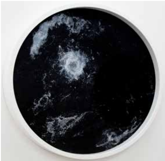
0.1.1 Pasado Pigmento sobre hierro 85 x 85 cm 2019