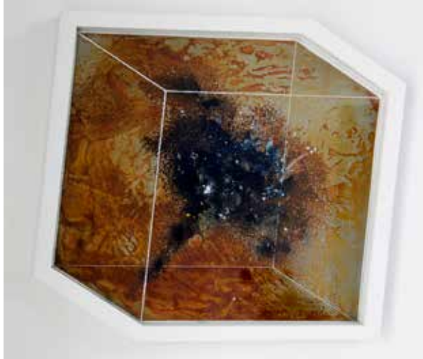
0.3.2 Sólidos Platónicos: Cubo / Platonic solids: Cube placa de hierro/ Iron Plate 28 x 26 cm 2019