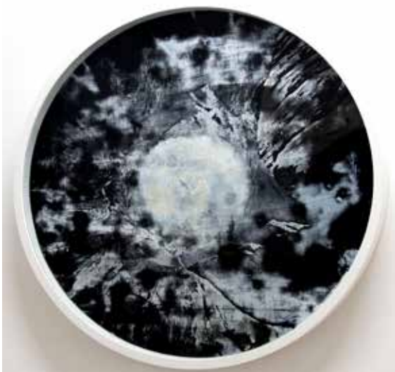
0.1.3 Futuro Pigmento sobre hierro 85 x 85 cm 2019